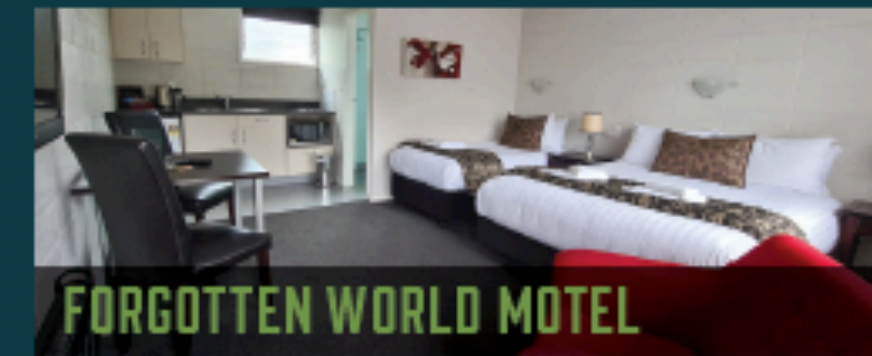
FORGOTTEN WORLD MOTEL

Centrally located in Taumarunui, this is the ideal base for your Forgotten World adventure. We offer a range of comfortable ensuite rooms within easy walking distance of cafés, restaurants and shops and are well situated for wider exploration of the Ruapehu region. Book to stay the night before or after your experience for comfort and convenience - all adventures leave from our front door.